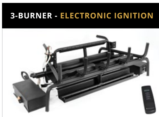
Available in Size 24" & 30"