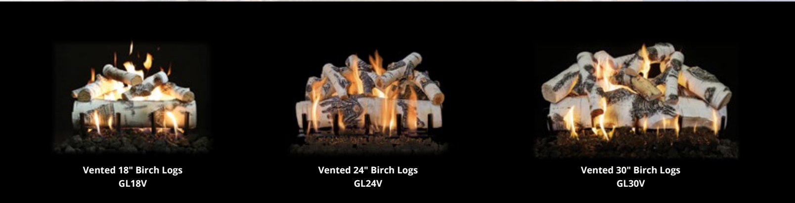
Vented 18" Birch Logs GL18V