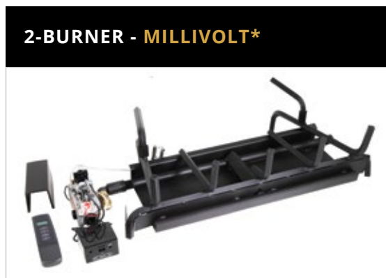
Available in size 18"