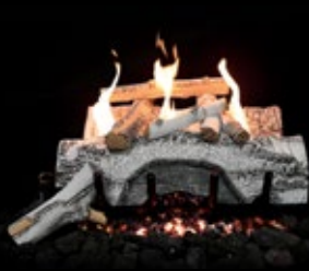
Vent-Free 18" Birch Logs GL18VF