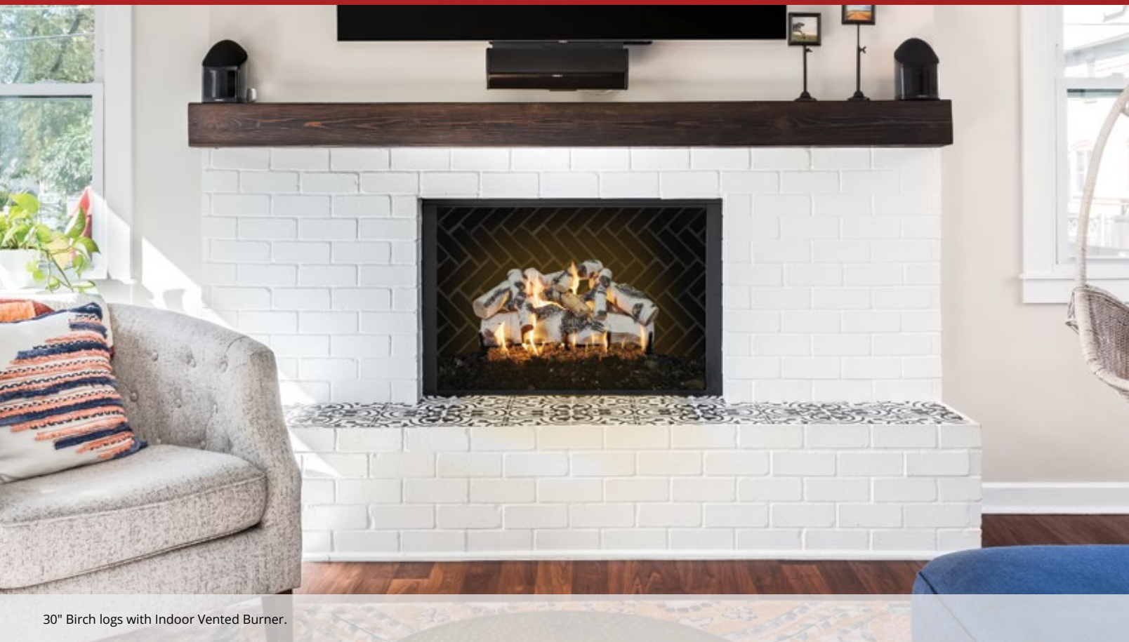
30" Birch logs with Indoor Vented Burner.