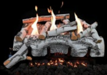
Vent-Free 24" Birch Logs GL24VF