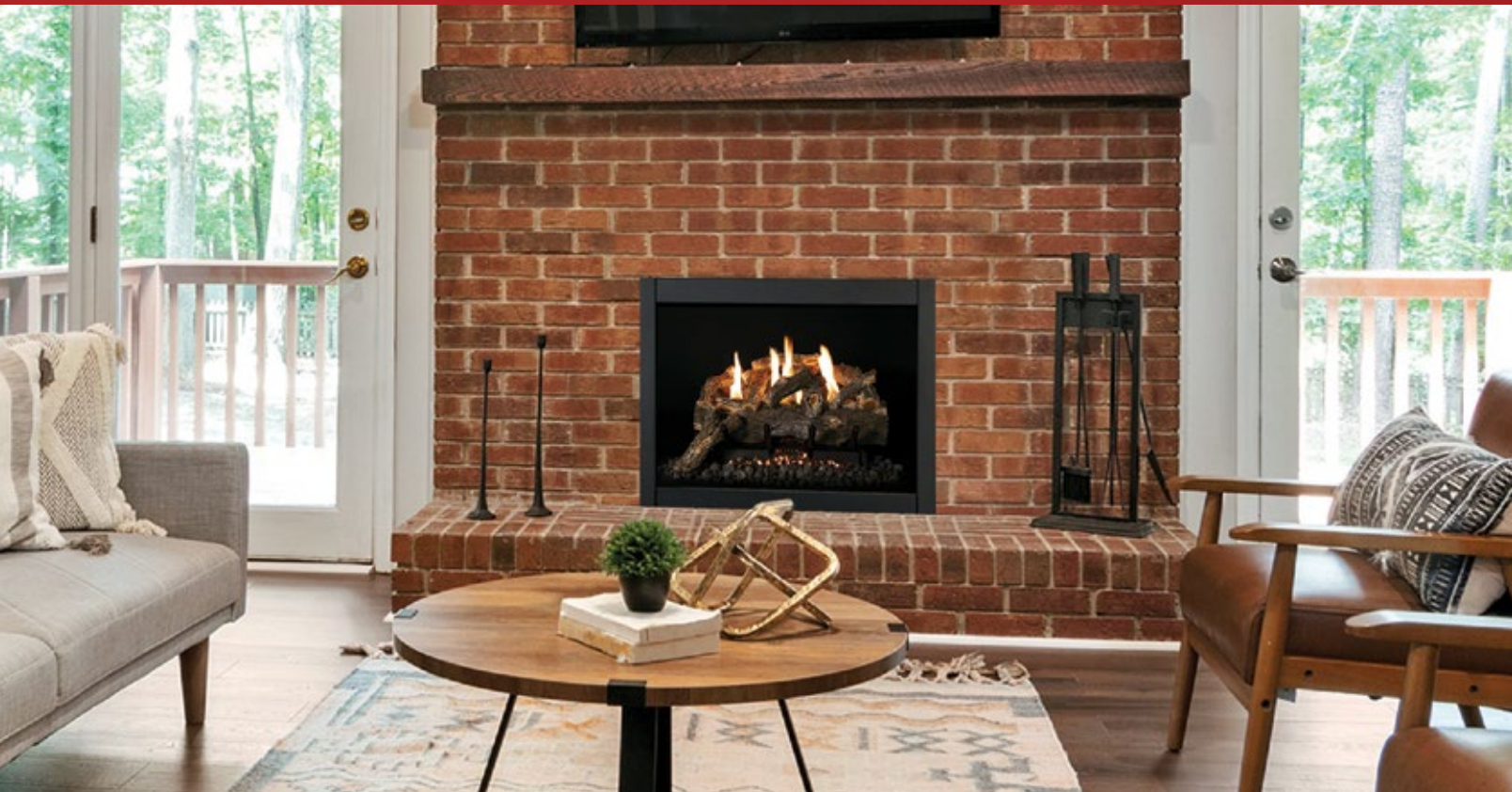
24" Oak logs with Indoor Vent-Free Burner.