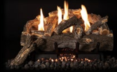
Vent-Free 24" Oak Logs GL24VF