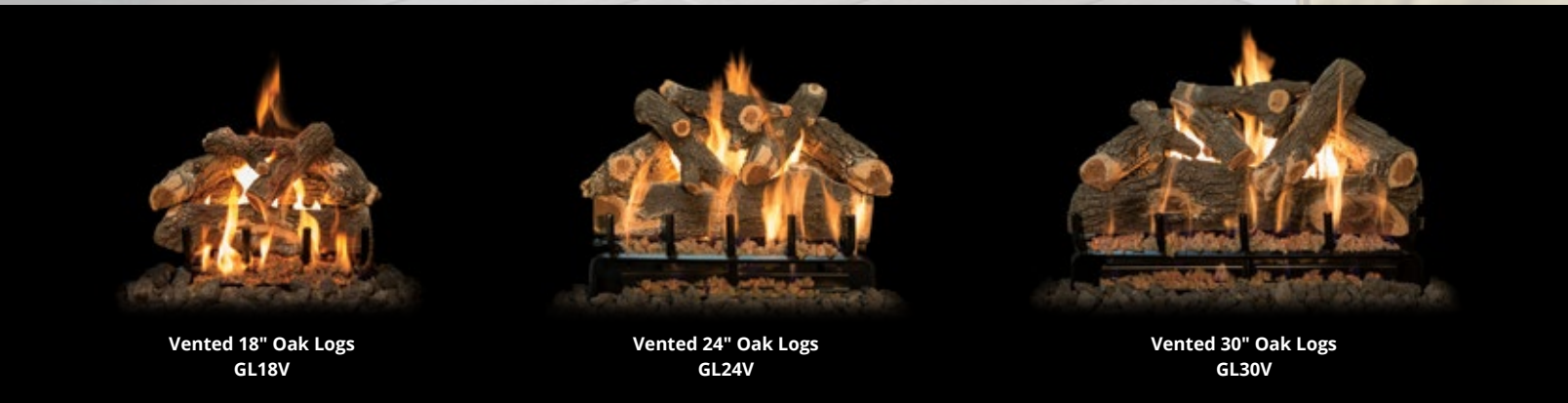
Vented 18" Oak Logs GL18V