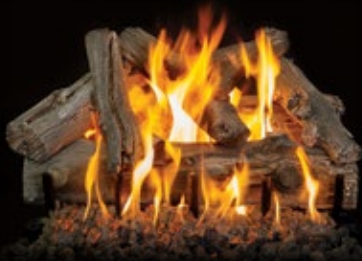
Vented 24" Driftwood Logs GL24V