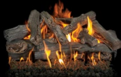
Vented 30" Driftwood Logs GL30V