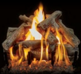
Vented 18" Driftwood Logs GL18V