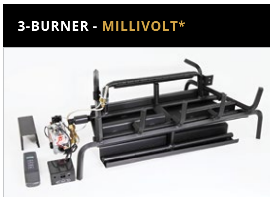
Available in size 24" & 30"