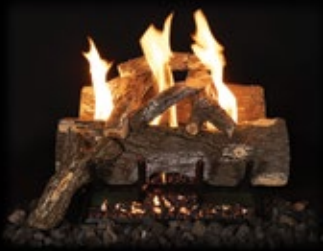
Vent-Free 18" Oak Logs GL18VF