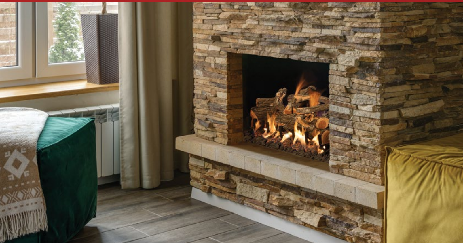
30" Oak logs with Indoor Vented Burner.