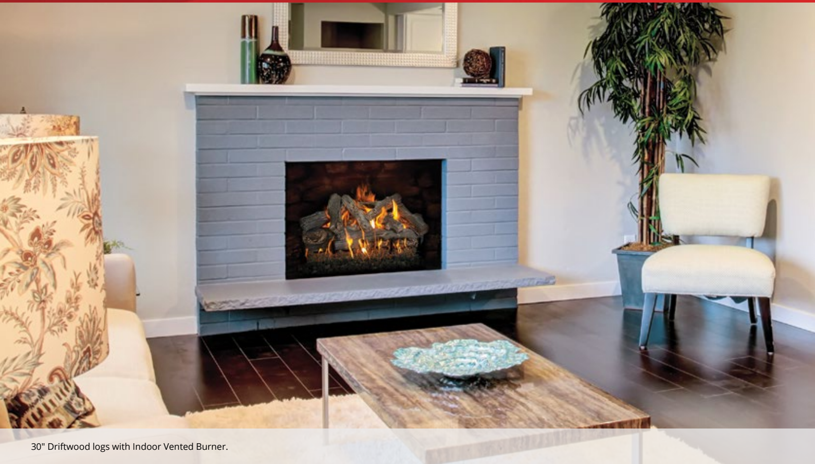
30" Driftwood logs with Indoor Vented Burner.