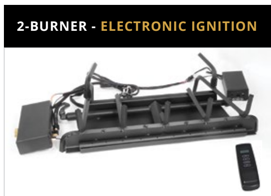
Available in Size 18"